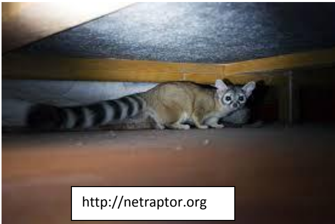
Ring Tailed Cat