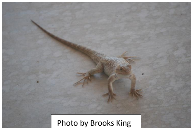
Lizard - Horned Lizard